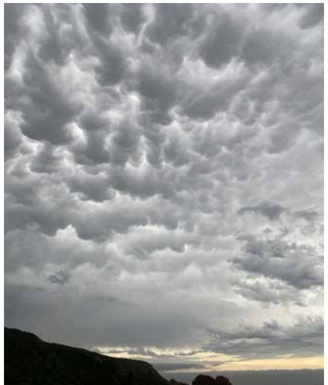
Mammatus or mammary clouds, breast-like protrusions that are formed when cold air descends from the base of a cloud, creating pockets that condense and form these pouches. Often associated with thunderclouds, as these were on 28/3/25