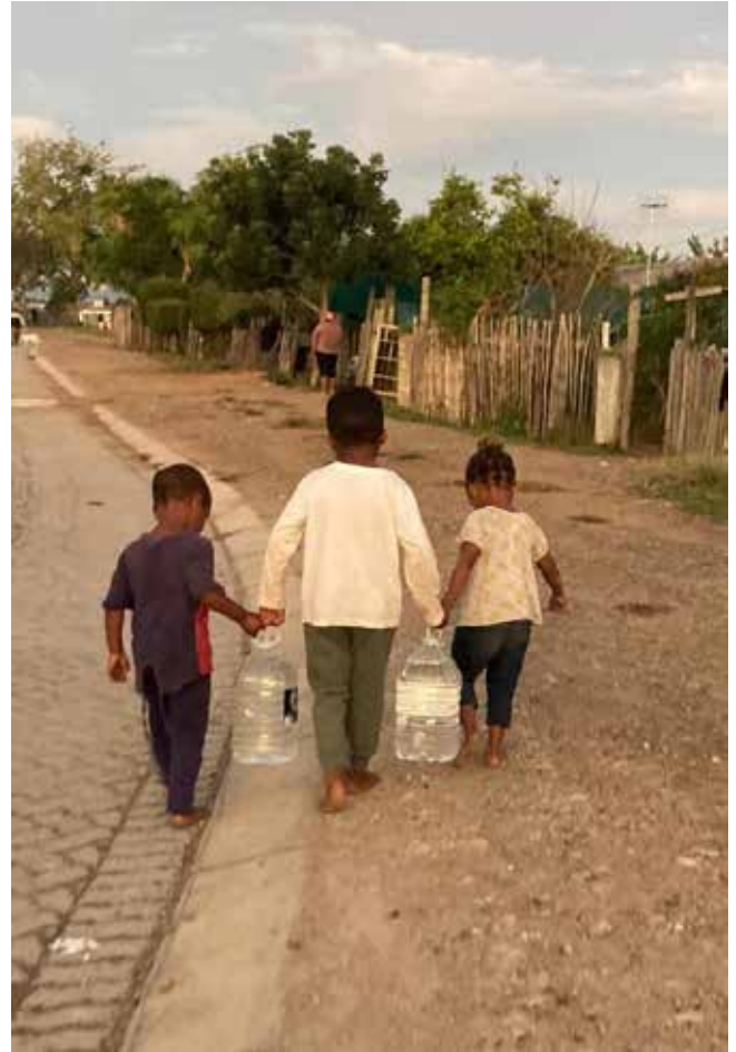
Tankers distributed water all over Knysna.