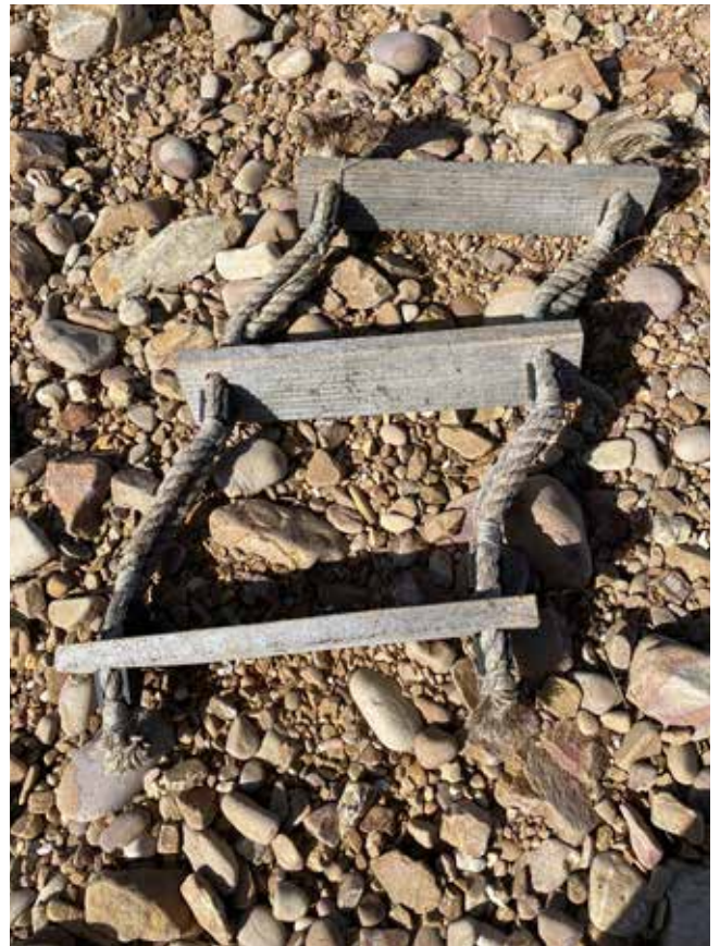
Flotsam: steps from a boat washed up at Shelley Beach: 27/4/25