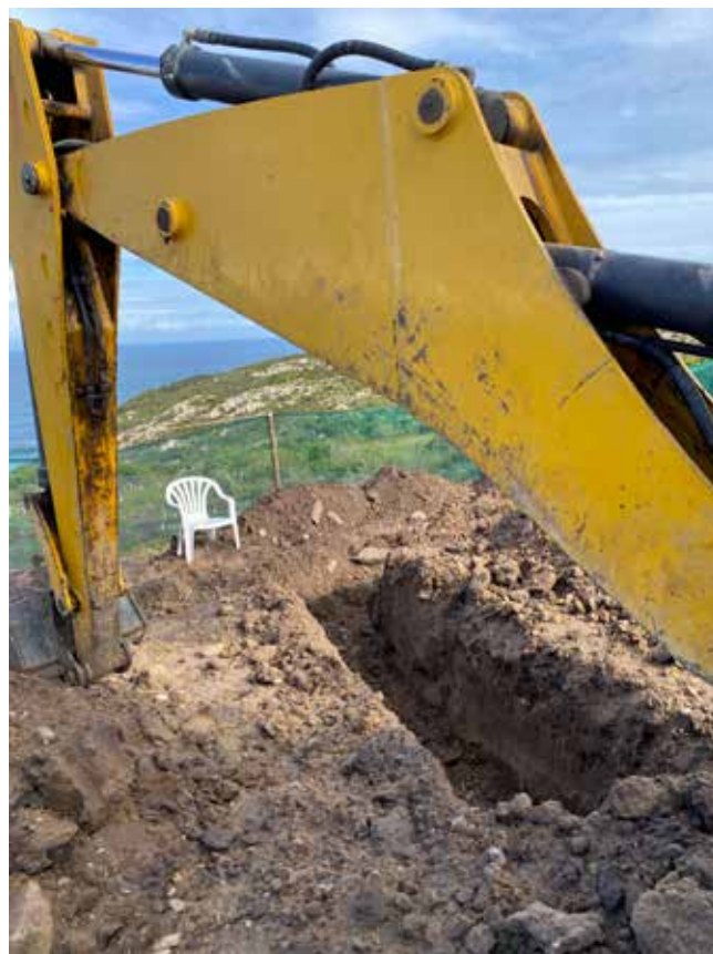
Work on headland erf 20372.

Rubbish collection is still on Tuesdays.