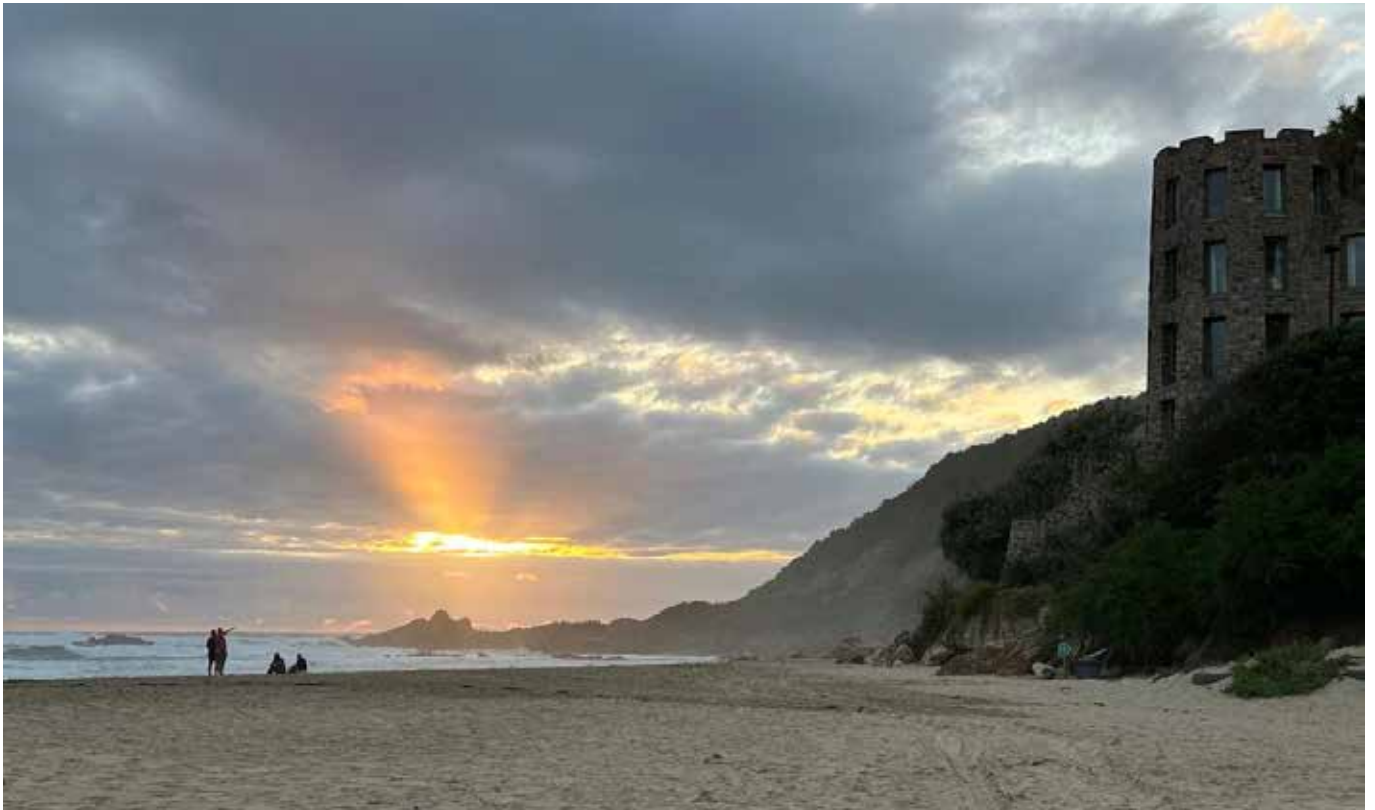
Shaft of gold through dark rain clouds: 5.33pm on 23/12/24