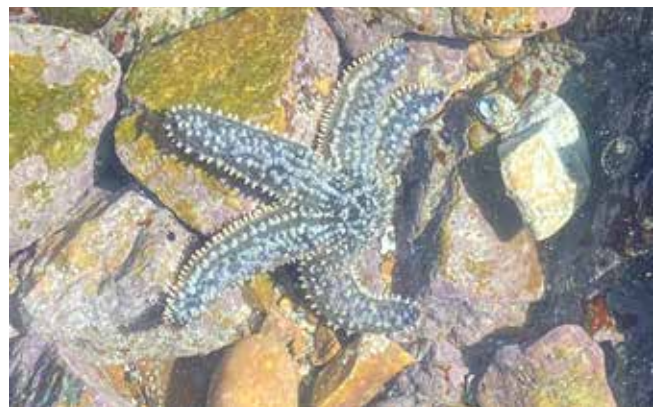
Spiny starfish ( Marthasterias africana )