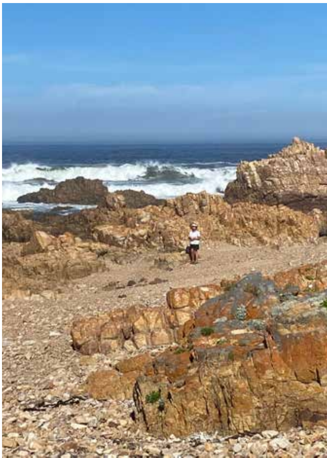
Shelley Beach 27/4/25