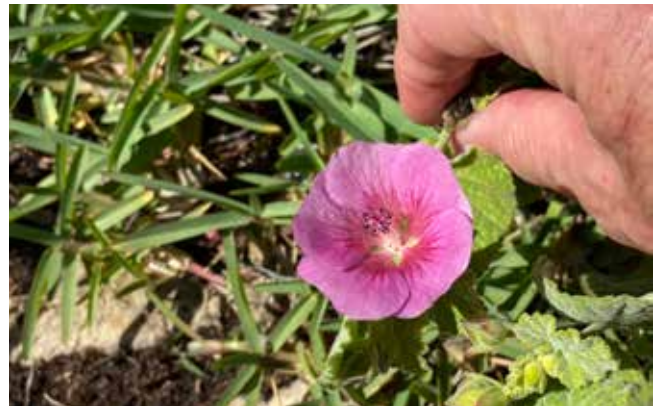
Sandrose Mallow ( Anisodonteia scabrosa )