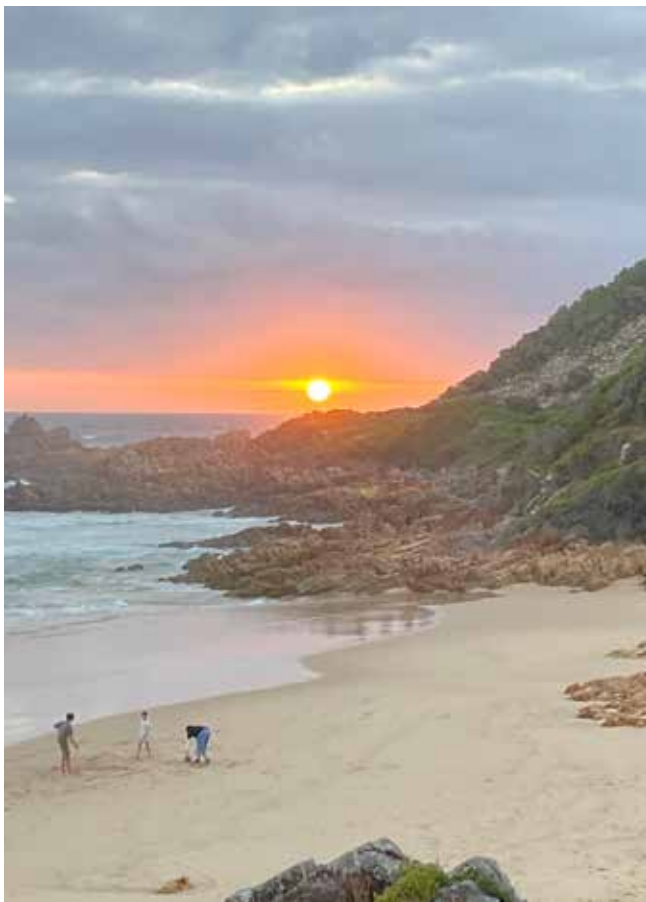
Beach games on Old Year's Night. 7.37pm on 31/12/24