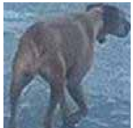
Johann Oosthuizen did some software magic to extract these animal sightings from the security camera footage.