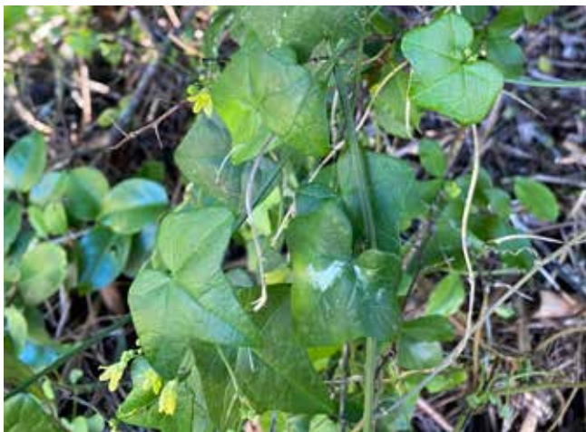
Porcupine potato ( Kedrostis nana )