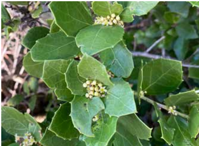
Dune Kokotree ( Maytenus procumbens )