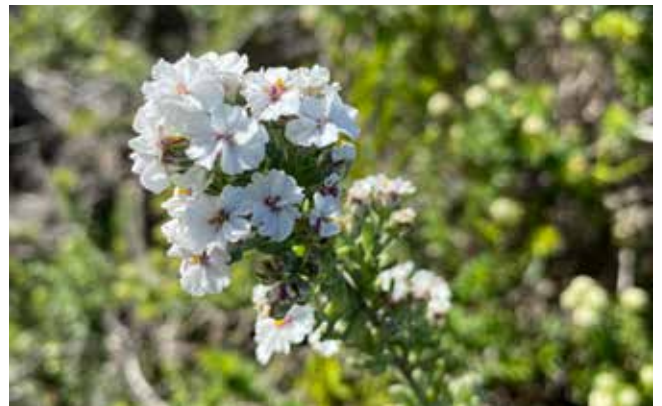
Snow bush ( Eriocephalus africanus )