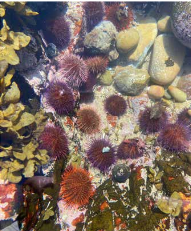
Marine life in Shelly Beach rock pools has been depleted, perhaps by foraging baboons displaced from their traditional foraging areas around fenced Pezula. Prickly sea urchins were the only species in abundance. 27/4/25