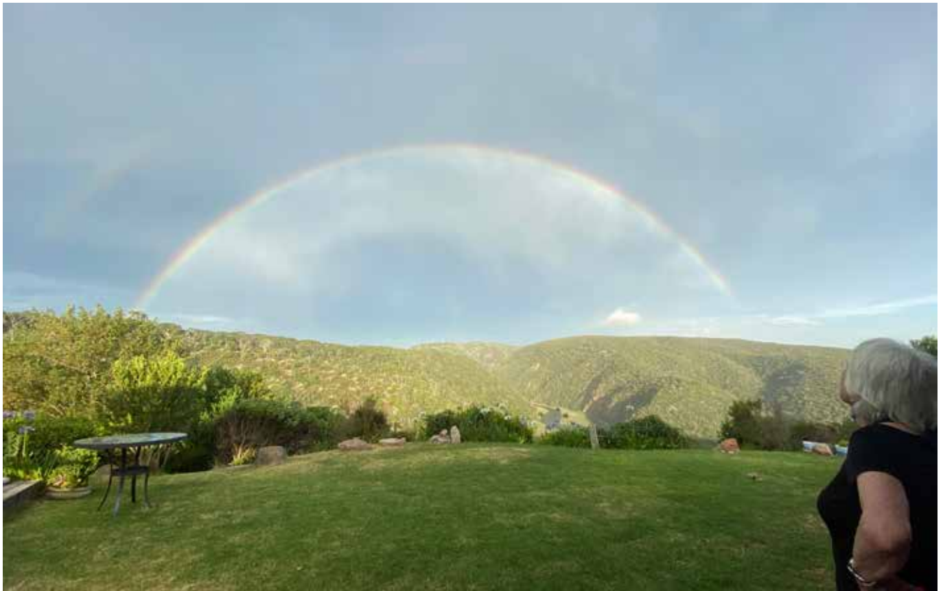
Rainbow spans Noetzie River. 6.43pm on 26/12/24