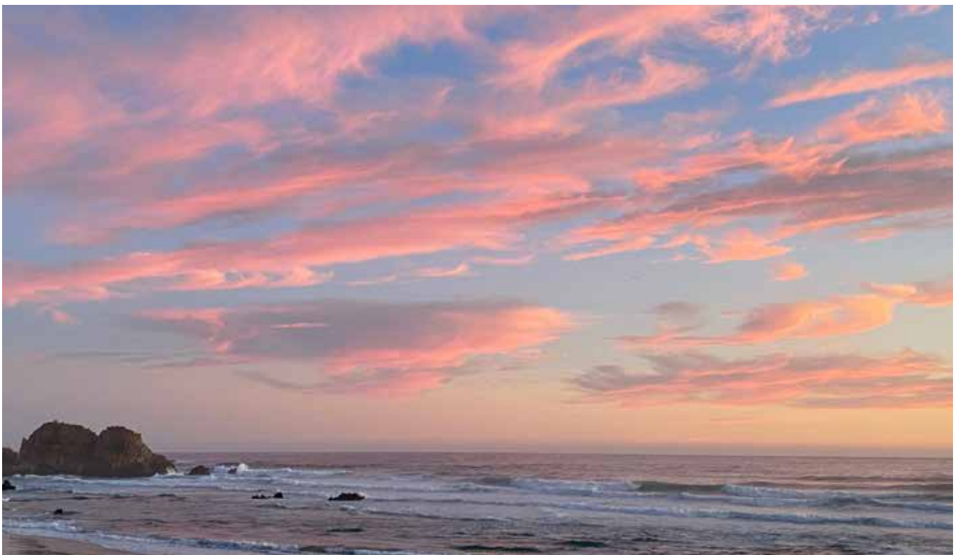
Pink clouds catching the sunset: 7.44pm on 10/12/24