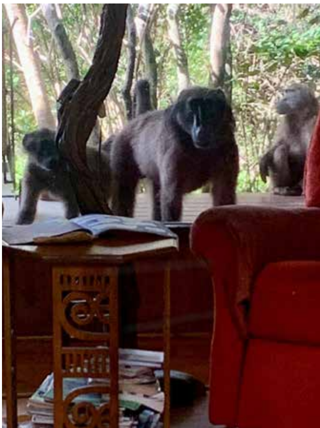
There's a troop on my stoop. Curious baboons peer in to the Browne's living room, but spied no easy pickings.