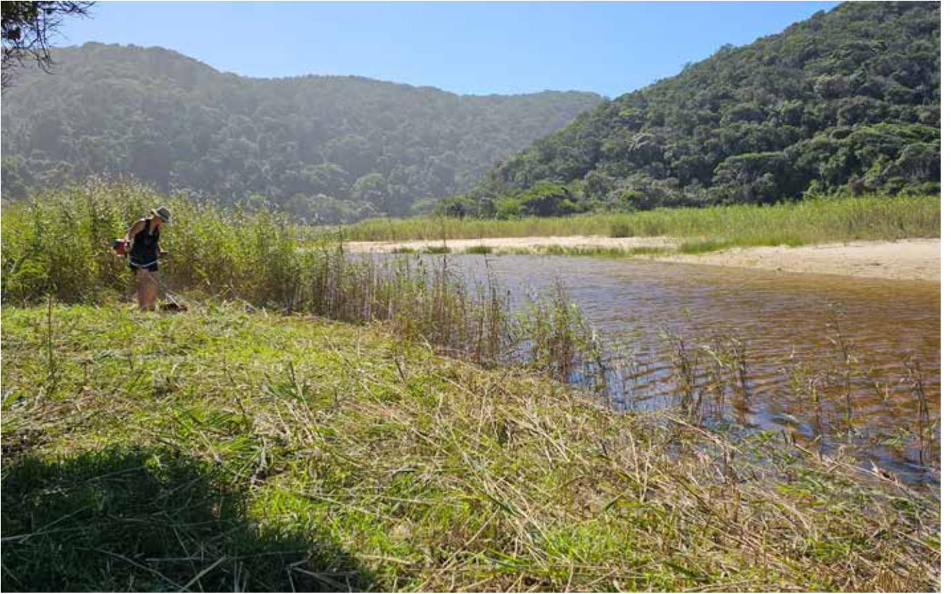
Clearing: Wendy Dewberry at work clearing reeds from the old picnic site; 18/4/25