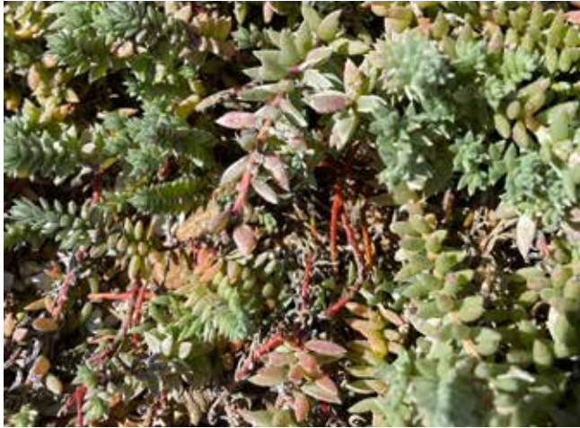
Beach Soutbos ( Chenolea diffusa )

Below are a few of the more unusual Noetzie species I recorded.