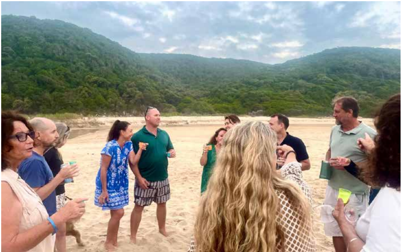
Noetzie residents join in the 50th birthday drinks on the beach.