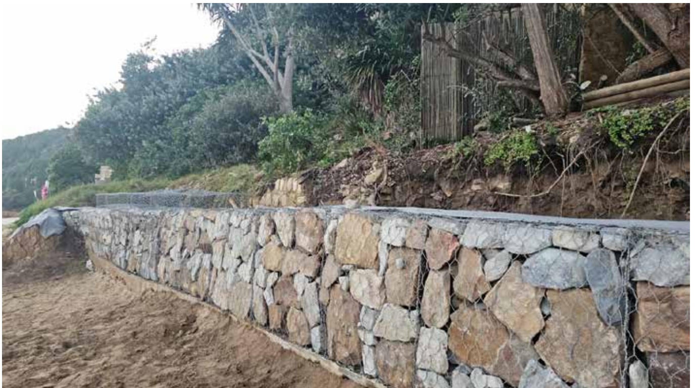
Repairs: The beach path repairs have stopped as the Disaster Fund money allocated to the municipality for repairs has run out.