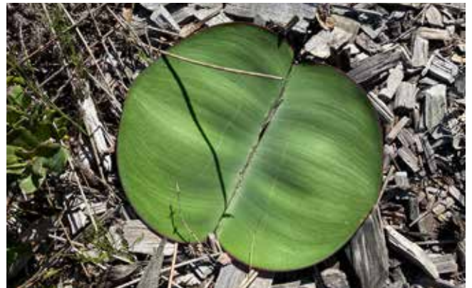
Smooth blood lilly ( Haemanthus sanguineus )