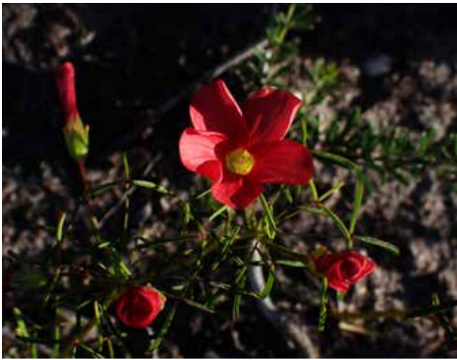
Rare: the Hangleaf sorrel ( Oxalis pendulifolia ) is one of the rare plants that have been saved on the Bhyat property.