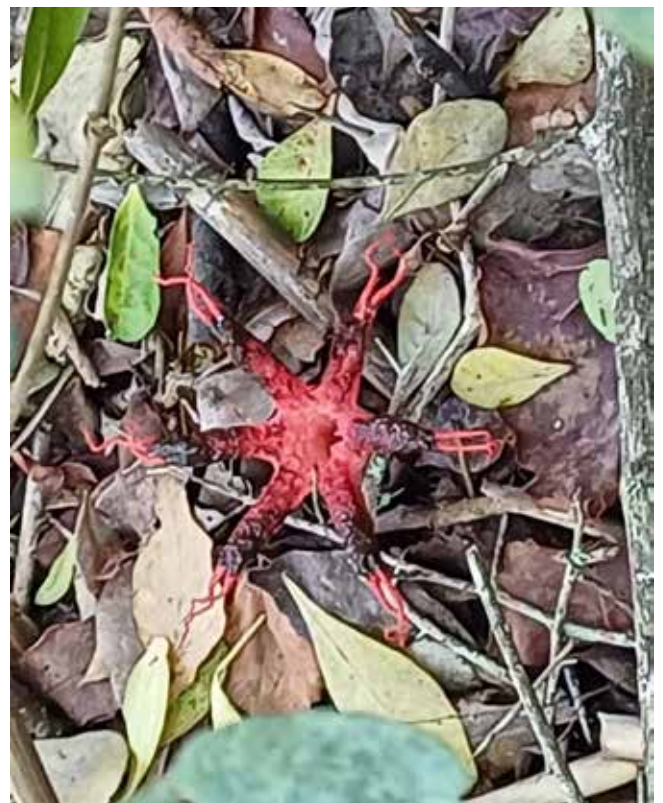
Stinky: This anemone stinkhorn fungus ( Aseroe rubra ) smells like rotting meat so attracts flies that get covered in spores and then shed them at new locations. Spotted along the Noetzie River boardwalk 25/4/25