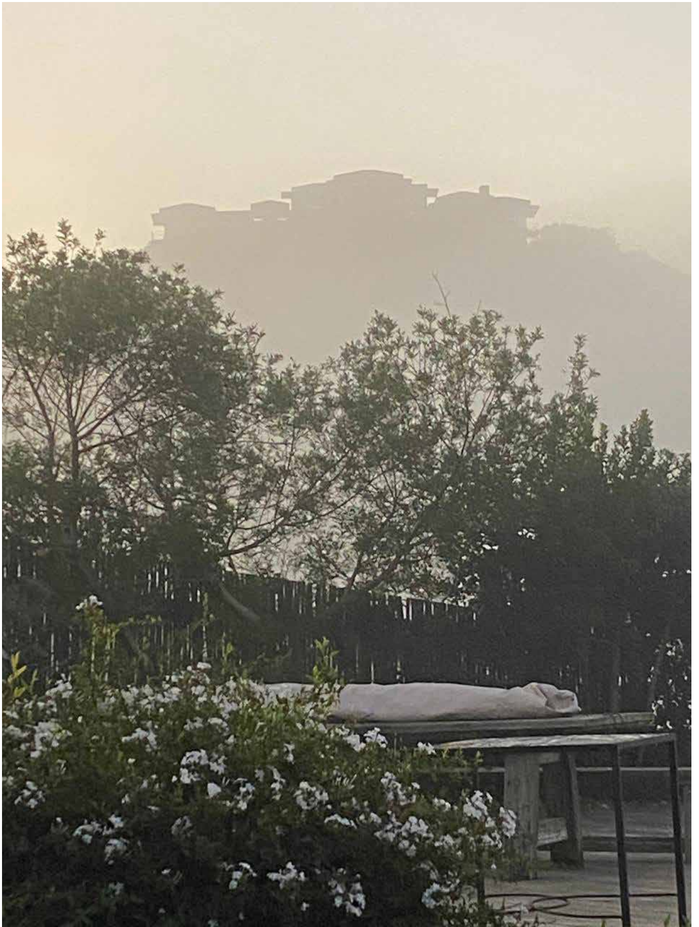
The "Russian's House" eerie in a late afternoon mist: 9/5/25